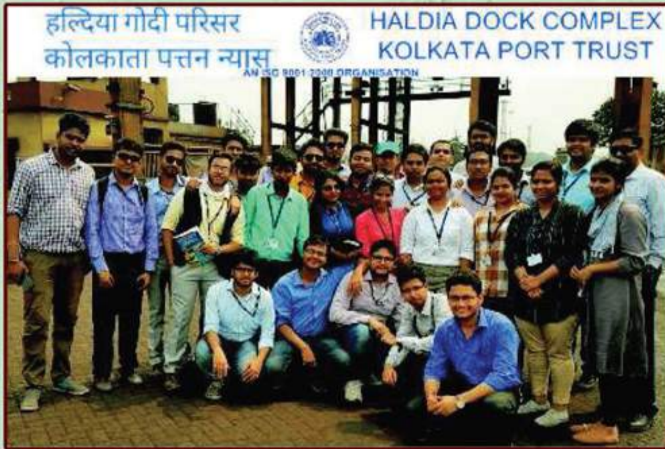
Visits to Haldia Port, Dankuni Railway freight station and Kolkata Port were organised for the students of 2017-2019 Batch.