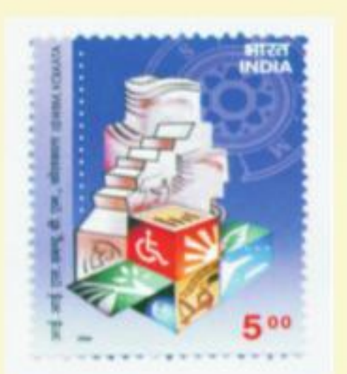
The Institute has the unique distinction of having its postage stamp released by the Government of India, Department of Post to commemorate its Golden Jubilee.