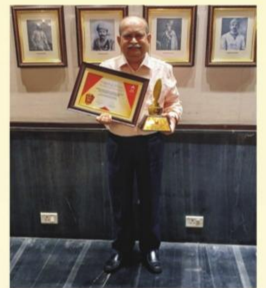
IISWBM honoured with Ananda Shiksha Ratna Award 2023