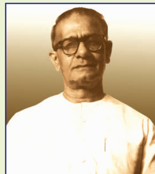
Prafulla Chandra Sen, Chief Minister of West Bengal (1962-1967) & President Board of Governors (1963-1990)