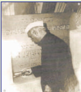
Pandit Jawaharlal Nehru laying the Foundation Stone of the Academic Block-1958

IISWBM is supported by some of the most acclaimed organisations like the Ministry of Scientific and Cultural Affairs: Government of India, All India Board of Technical Studies in Management: Ministry of Education, Government of West Bengal, Bengal Chamber of Commerce and Industry, Indian Chamber of Commerce, Bharat Chamber of Commerce and Bengal National Chamber of Commerce and Industry.