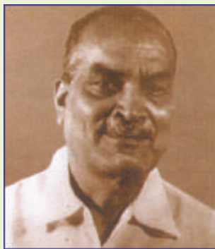
Dr. B. C. Roy, Chief Minister of West Bengal (1948-1962) & the Founder President Board of Governors