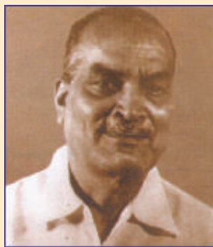
Dr. B. C. Roy, Chief Minister of West Bengal (1948-1962) & the Founder President Board of Governors