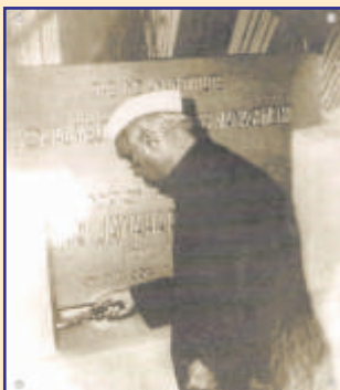
Pandit Jawaharlal Nehru laying the Foundation Stone of the Academic Block-1958

IISWBM is supported by some of the most acclaimed organizations like the Ministry of Scientific and Cultural Affairs: Government of India, All India Board of Technical Studies in Management: Ministry of Education, Government of West Bengal, Bengal Chamber of Commerce and Industry, Indian Chamber of Commerce, Bharat Chamber of Commerce and Bengal National Chamber of Commerce and Industry.