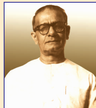
Profulla Chandra Sen, Chief Minister of West Bengal (1962-1967) & President Board of Governors (1963-1990)